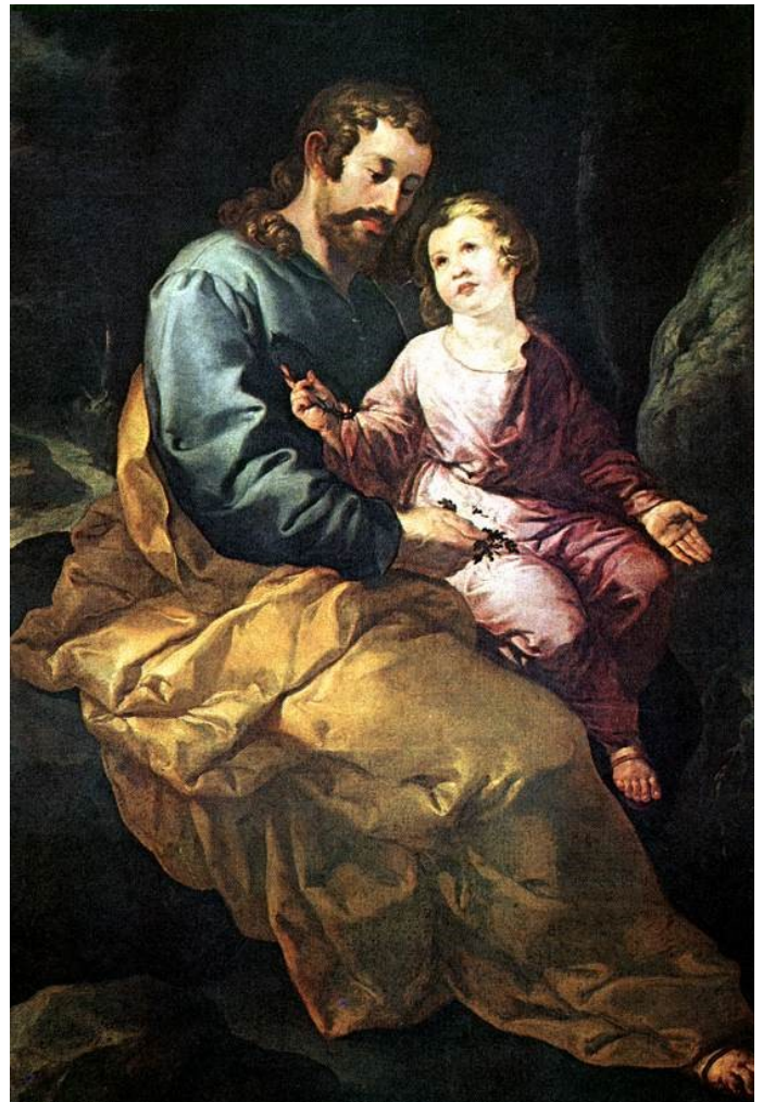
Francisco Herrera the Elder: San José y el Niño Jesús , 1648. Lázaro Galdiano Museum, Madrid, Spain.