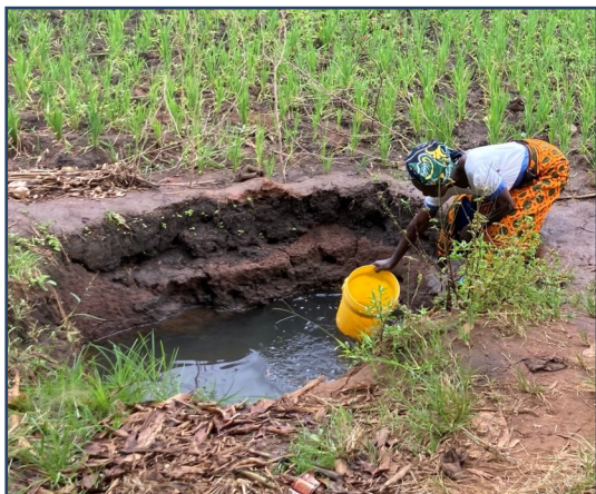
In the morning, we got water from this traditional water source.