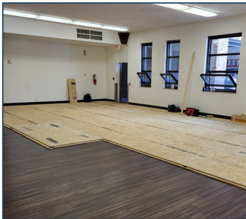
Build a shop floor in the back of the cafeteria (have outgrown the garage)