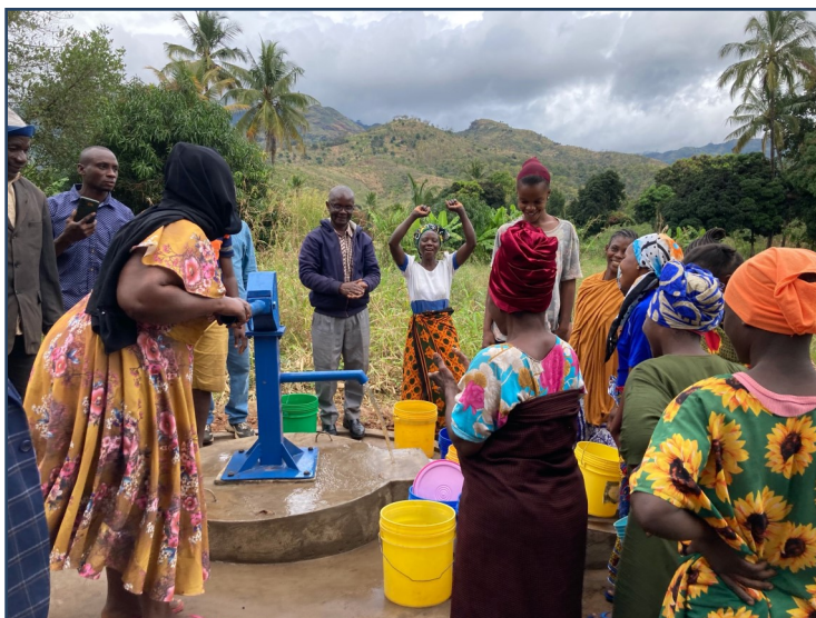
The villagers celebrated that they have plenty of fresh, safe water for everyone!