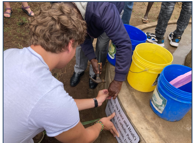
The well is completed and dedicated.