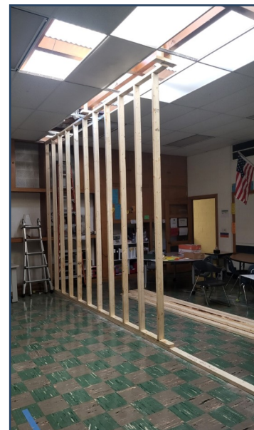
Build a 20' wall to divide a classroom into two rooms