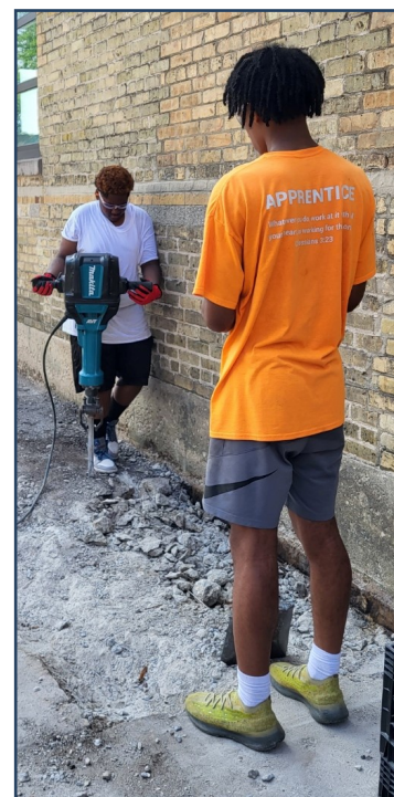
Remove the outside raised platform next to the back school exit