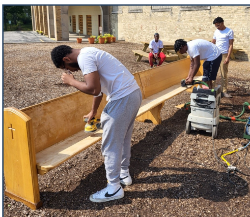
Sand & refinish one of our church pews (pilot project for possibly more)