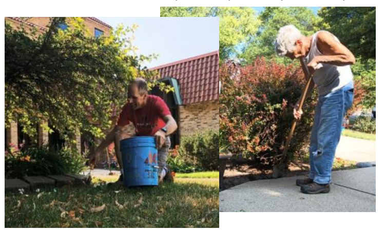
Two of our Garden Angels hard at work.

Sometimes we can float through life without being conscious of what we have that supports us. I invite us to take some time in the summer lull to reflect on what a gift our Pius community is to us and what a support we are to each other, resolving to build our bonds even stronger. We are truly blessed. Thank you for being a part of St. Pius X Catholic Community. May God bless each and every one of you and your family.